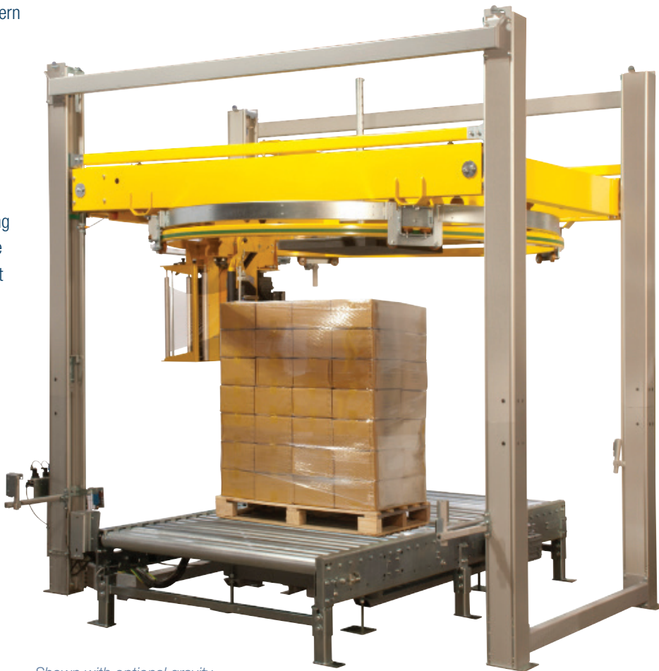
Shown with optional gravity type load stabilizer.

Compact, aluminum frame structure along with a well balanced ring and belted lifting device results in quiet, efficient performance and minimal maintenance